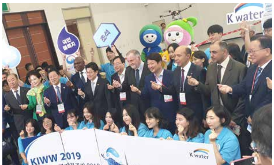
Korea International Water Week opens with a strong political presence from the Minister of Environment of Korea, as well as Ministers from Senegal, Algeria and Sri Lanka, the Mayor of Daegu, the Deputy Speaker of the National Assembly and other esteemed participants, 4 September 2019

Korea International Water Week opened with strong political presence from the Minister of Environment of Korea, as well as Ministers from Senegal, Algeria and Sri Lanka, the Mayor of Daegu, the Deputy Speaker of the National Assembly and other esteemed participants. Loïc Fauchon made recommendations on preserving the balance between humans and nature and emphasized that instead of a digital divide, technology must serve humankind. He further reminded the importance of political will during the meeting of the Water Leaders Roundtable, in which over 30 high-level politicians and decision-makers from around the world participated.